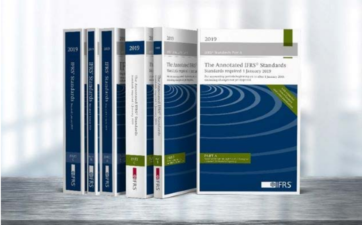
IFRS Standards Required 1 January 2019 (Blue Book)